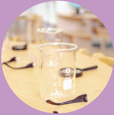
Junior Preschool 3-4 years

Our Preschool is divided into two distinct, aged based classes: