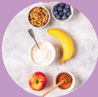
Morning Tea 9:30am