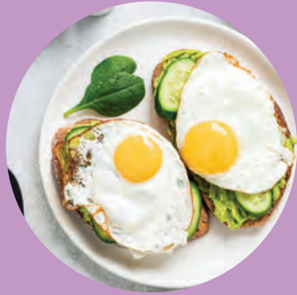
Breakfast 7:30 -8:30

Our Preschool provides five nutritious meals to support the health, well-being and ongoing development of each child.