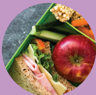
Late Afternoon Snack 5:00pm