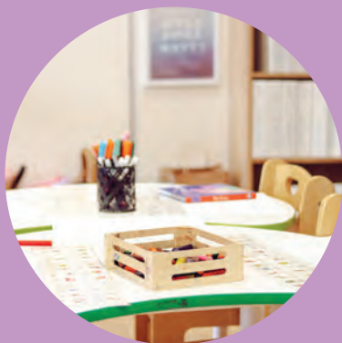
Preschool 4-5 years

Both Preschool classes use the same Preschool Program to plan and implement a range of educational experiences. Within each class, the educational activities are tailored to best support the developmental needs of each child, appropriate to their distinct age groups.