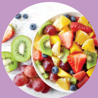
Afternoon Tea 2:30pm